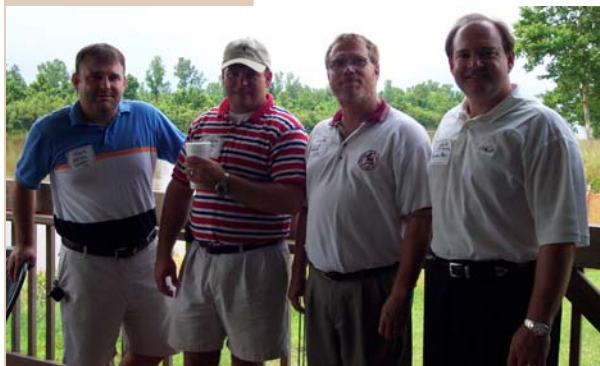
Caddo-Bossier Crawfish Boil