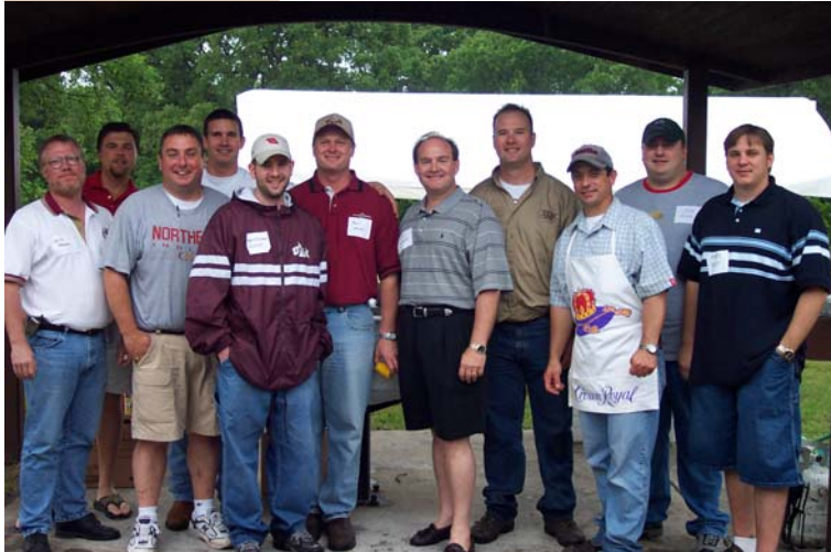
Dallas Crawfish Boil