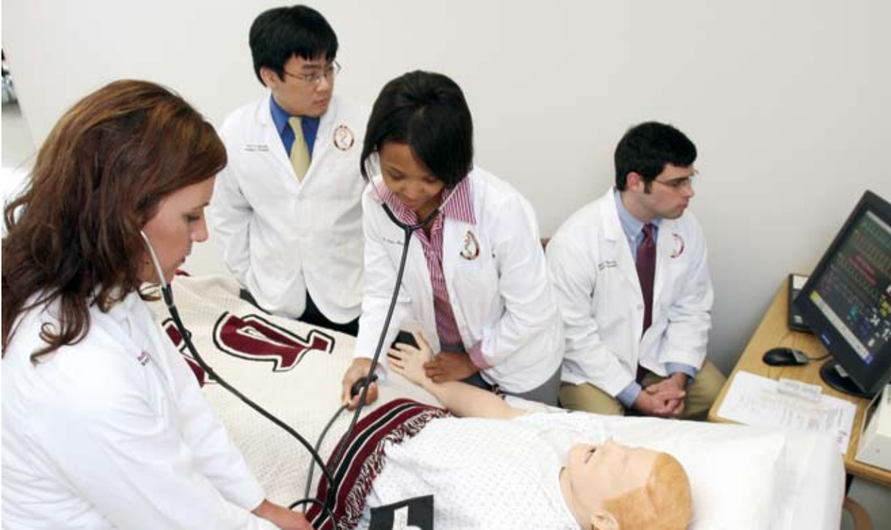
ULM College of Pharmacy students work on Sim-Man, their simulated patient. Through their work with Sim-Man, ULM students learn about subjects like drug interactions and drug disease states.