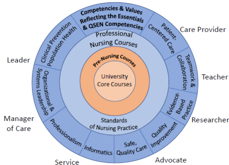
Roles of the Baccalaureate Nurse