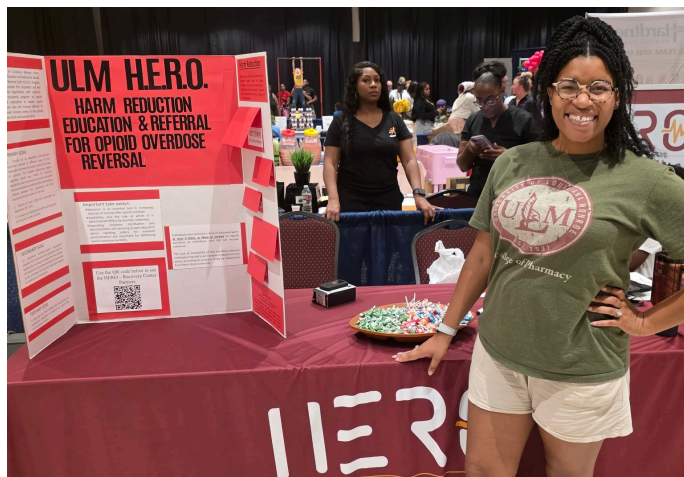
ULM HERO attended the Community Health & Wellness Expo at the Monroe Civic Center on August 4.