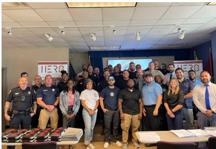
ULM HERO completed four training sessions with the Kenner Police Department in July.

In the past couple of months, the ULM HERO team has had the opportunity to train various groups on harm reduction and opioid overdose reversal tools. These groups include the Kenner Police Department, the Monroe Police Department, The New Orleans Mission homeless shelter, the New Orleans Police Department, the Jackson Parish Sheriff's Department, and a group of ULM Resident Advisors (RAs).