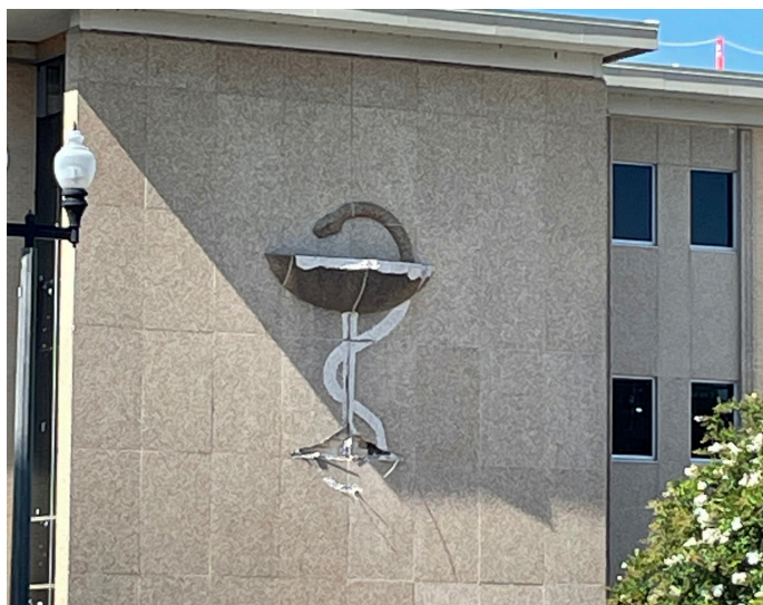
The Bowl of Hygieia that adorned the side of Sugar Hall since it was built in the early 1970’s, was recently removed to make way for building renovations.