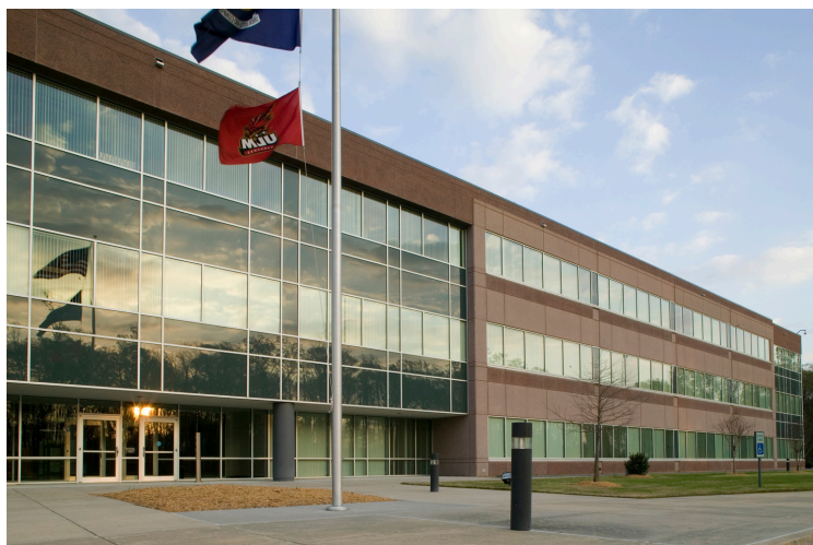
ULM College of Pharmacy Building, 1800 Bienville Dr., Monroe, LA

Make plans to celebrate 70 years with us in the Fall of 2026!