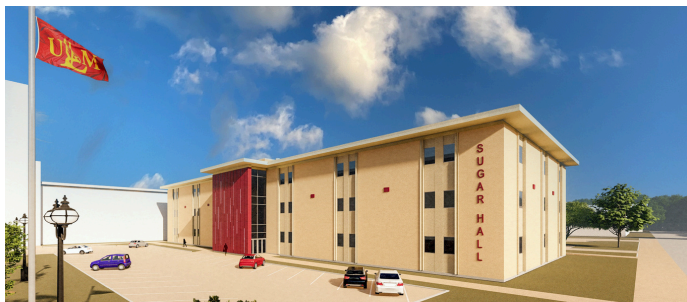
Photo rendering of the proposed updated exterior of Sugar Hall.