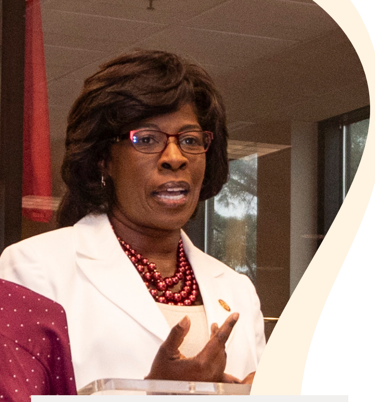
Vice President for Student Affairs